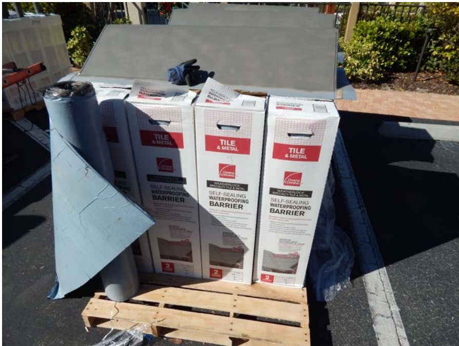
View of underlayment stored on-site.