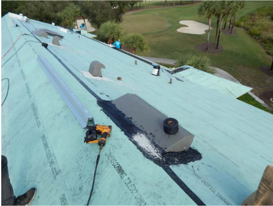
Building 24420: View of new underlayment installed.