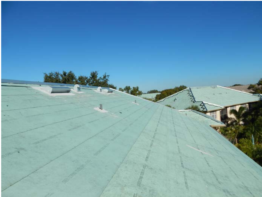
Building 24451: View of new underlayment installed.

The following photographs represent the conditions observed during our site visits.