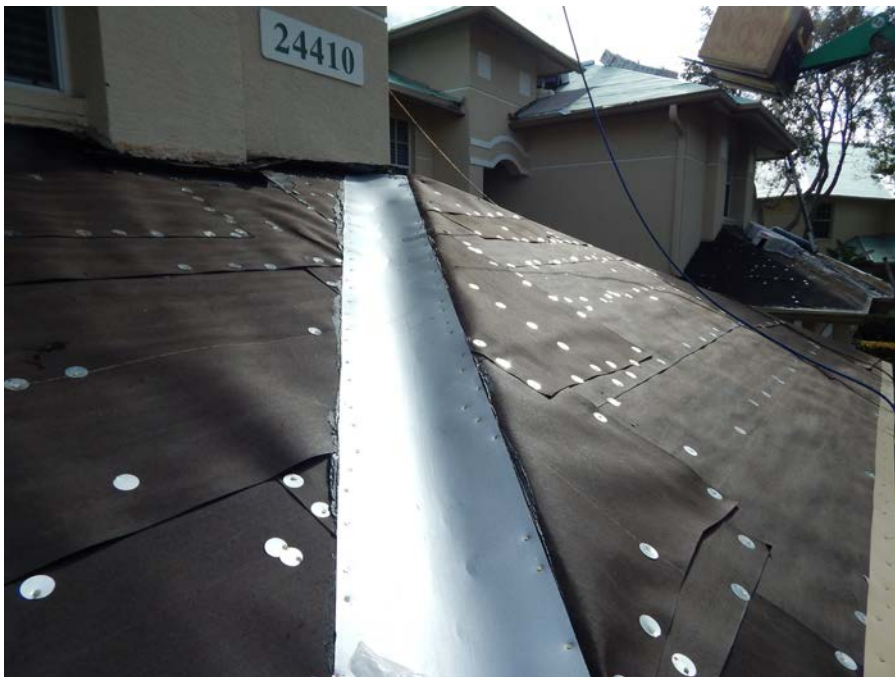
Building 24410: View of new valley flashing installed.