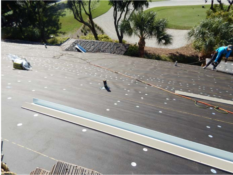
Building 24480: View of base sheet in the process of being installed.